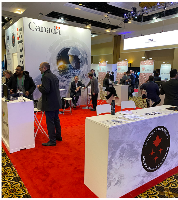
Canada's booth at the Space Symposium