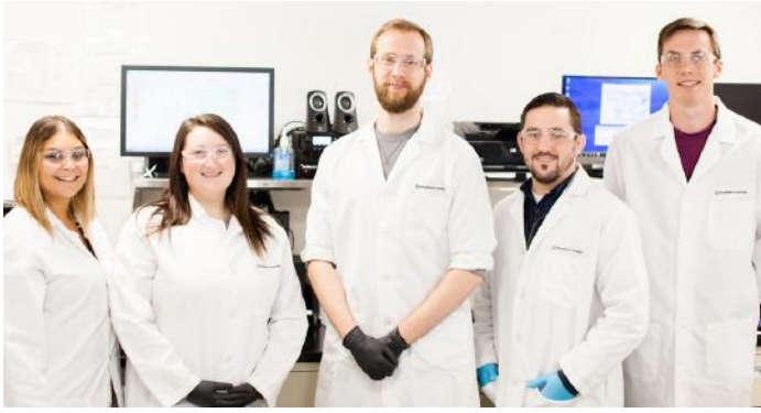
Brookfield office staff.