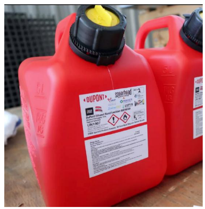
In response to the COVID-19 crisis, DuPont's Kingston, Ontario Technology Centre produced and donated hand sanitizer.