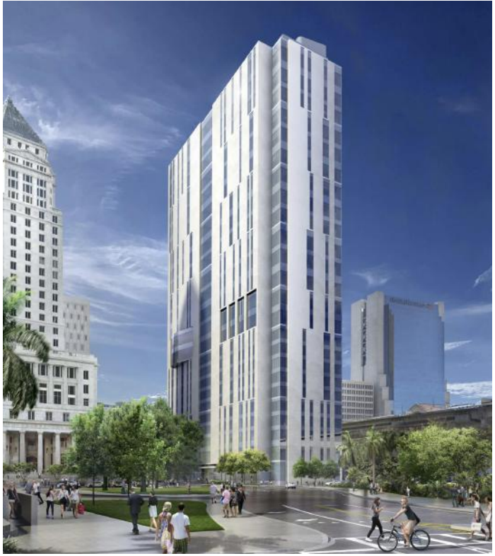
Miami Dade County Civil and Probate Courthouse.