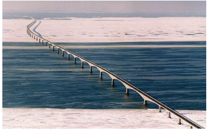
Confederation Bridge, the longest bridge spanning ice-covered waters