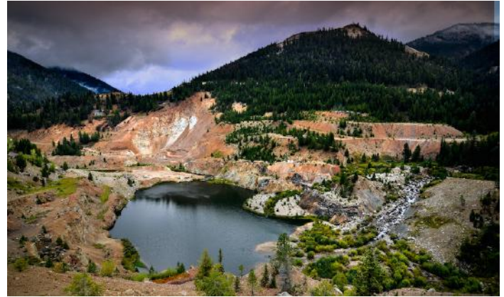
Stibnite Gold project pit.

Canadian-owned companies, including McCain Foods, Cyprus Thompson Creek Min, Great American Snacks and Nu-West Industries , are major contributors to Idaho's economy. They employ residents in every sector and contribute to the local economy with salary dollars, paying local taxes, and the purchase of goods and services in their supply chain.