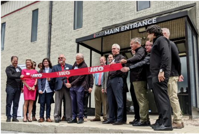
Ribbon cutting ceremony for the new IKO facility in Hagerstown.