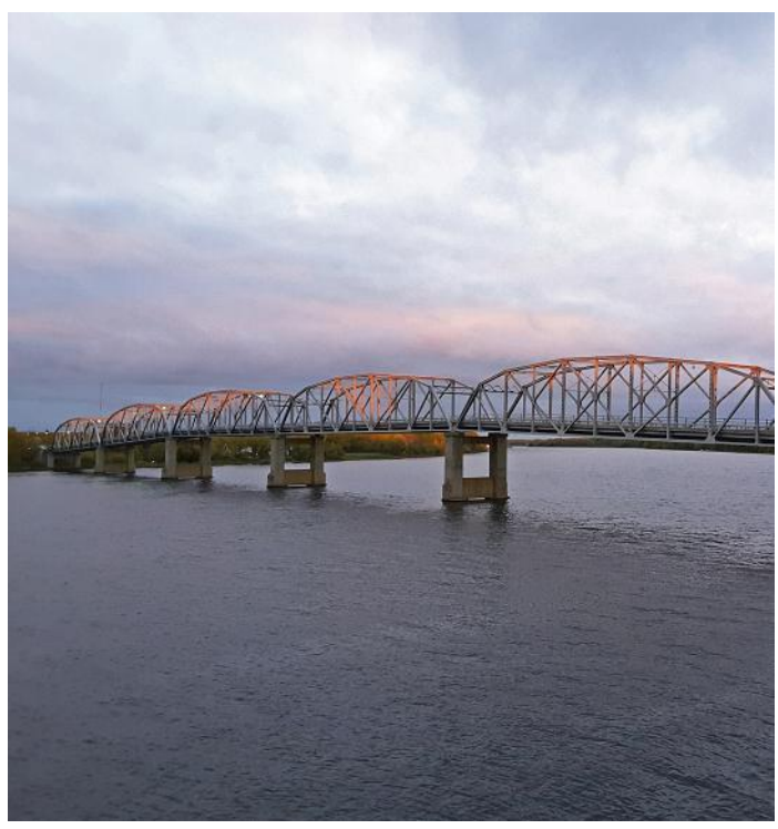
Baudette–Rainy River International Bridge.