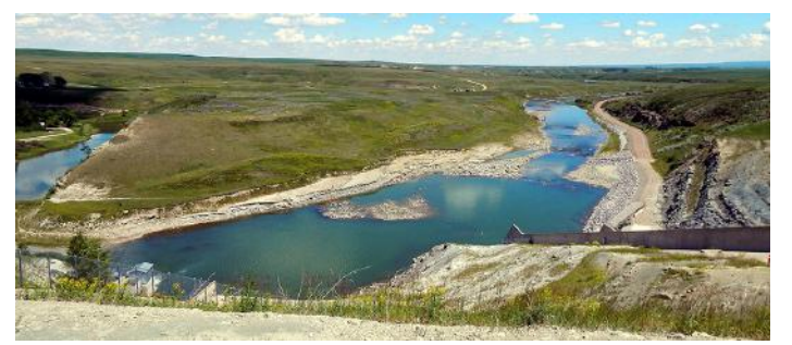
St. Mary & Milk Rivers