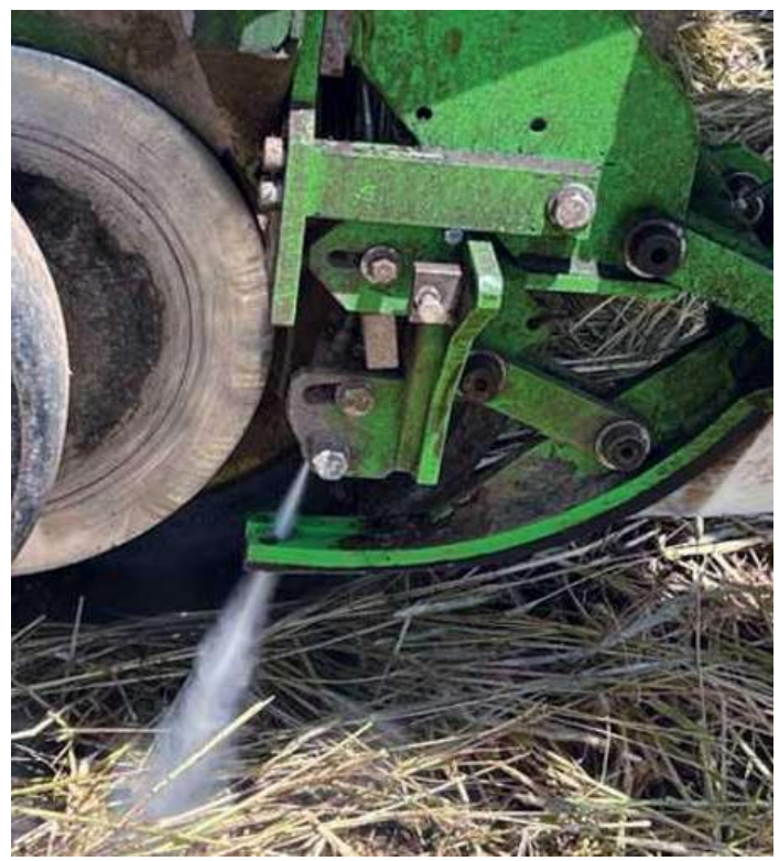
Ultra-high pressure water jet technology

81 Canadian-owned companies employ 4,400 workers in North Dakota