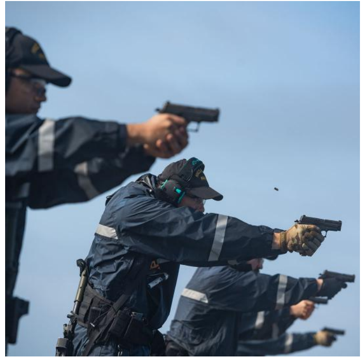
Members of the Naval Boarding Party fire SIG Sauer P320, as they practice their force protection drills.