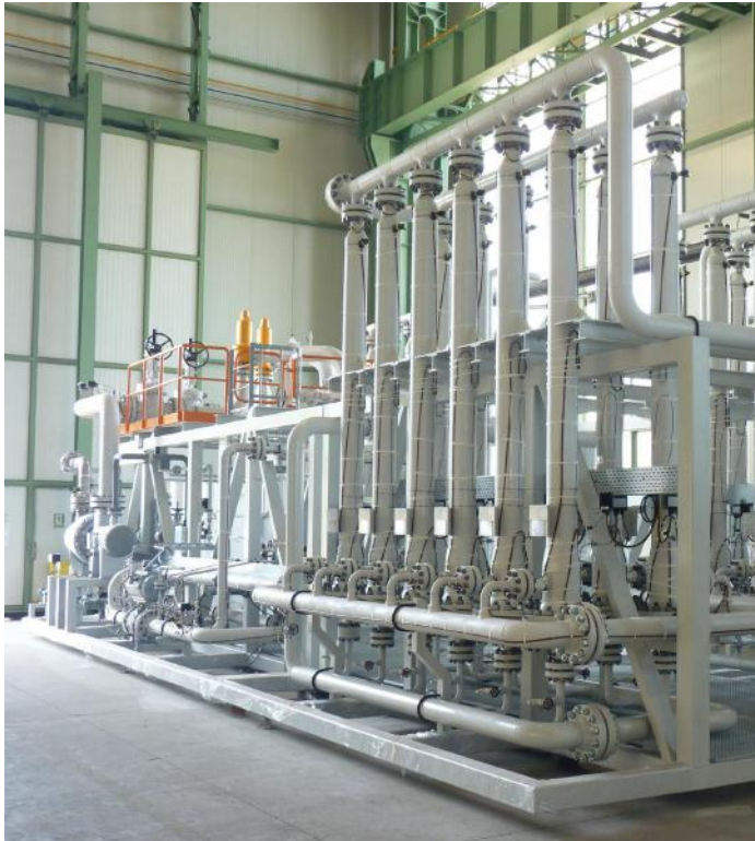
Membrane system for hydrogen recovery.