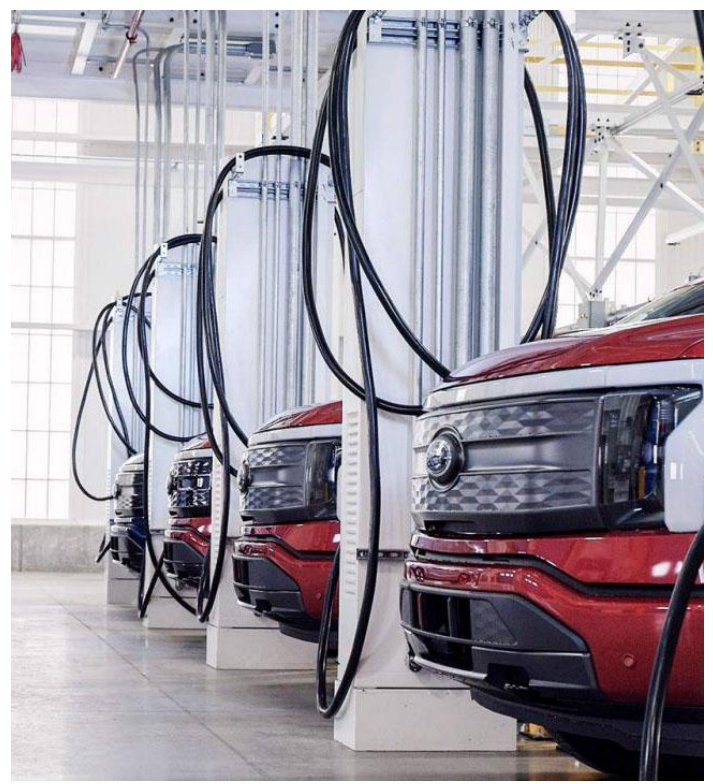
Ford F-150 Lightning.

150 Canadian-owned companies employ 11,700 workers in Tennessee